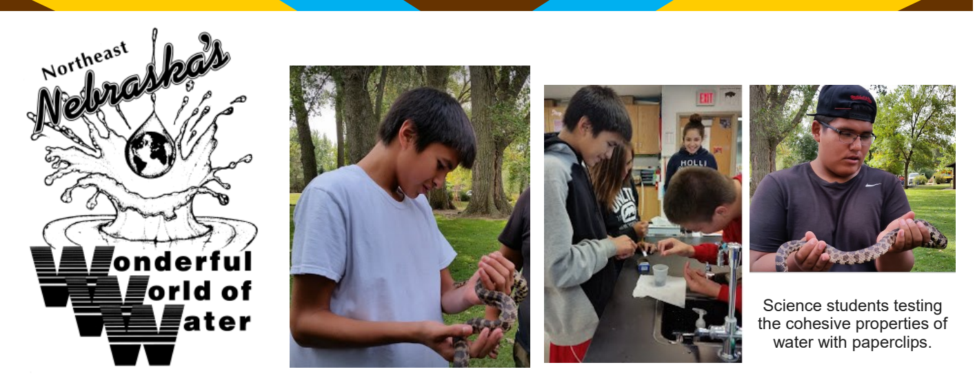
Wonderful World of Water Program held in Pierce

The Wonderful World of Water Festival was held September 21 at Gilman Park in Pierce. Twenty-four teams of ninth and tenth grade students from 13 schools across Northeast Nebraska descended upon the park for a day of outdoor hands on activities and a chance to via for championship honors.